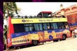
Hop on Hop off

For Hotel Booking / Tour & Travels Contact : +91 94171-55917 / +91 88728-18181 / +91 95924-00002